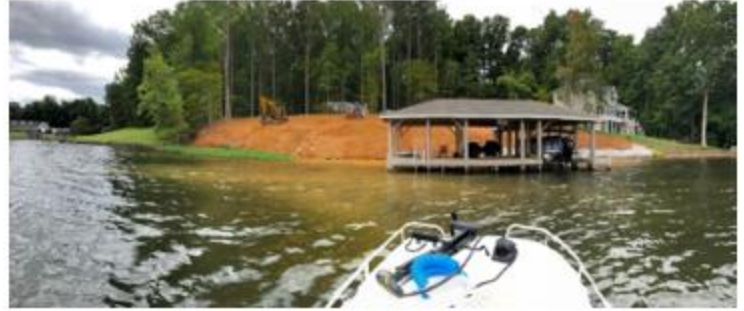
Inadequate erosion and sediment control at construction site on Lake Gaston.

There are slightly differing requirements regarding the planning for, and implementation of erosion and sediment control depending on the state and county where the activity is occurring. However, the bottom line is, allowing soil and sediment runoff into “waters of the state” from regulated land disturbing activities is prohibited. Lake Gaston is a “water of the state” and as such, measures must be taken to prevent sediment-laden runoff from construction sites entering the lake. The challenge is that local counties are sometimes hard-pressed to ensure property owners and construction firms understand and comply with the regulations. It is incumbent on those property owners and construction firms that are conducting regulated land disturbing activities to understand and comply with the requirements. The Lake Gaston Environment Committee is working to assist the local jurisdictions in making sure everyone is doing their part to reduce erosion and sediment runoff and help ensure the water quality of Lake Gaston. If you see instances of sediment runoff into the lake or adjoining creeks from construction activities, such as muddy/silty water along the shoreline or evidence of soil erosion leading into the lake, let your local county planning department know. Remember it's our lake for all to enjoy and protecting it is all our responsibility.