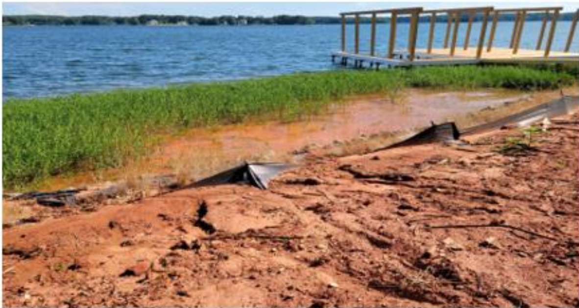
Failed silt fence along Lake Gaston Shoreline. Also, notice the soil erosion tracks and muddy water along the shoreline.

As property owners on Lake Gaston, we are all well aware of the importance of the water quality in the lake and the creeks that feed into the lake. Water quality has a direct impact on uses of the lake including boating, swimming, and fishing as well as a potable water supply source and habitat for wildlife. Maintaining and improving the condition of the water in Lake Gaston is important socially (quality of life), ecologically (wildlife habitat) and economically (property values and tourism).