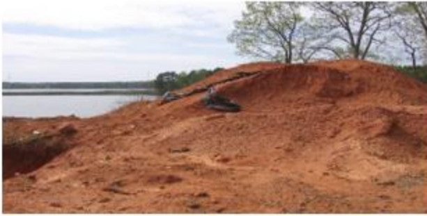
Inadequate erosion and sediment control at construction site on Lake Gaston.

a specific requirement for silt fencing for new construction sites. A silt fence is a best management practice (BMP) designed to stop disturbed soil from being carried into the lake during storm events. There are a variety of other BMPs that can also help minimize soil runoff from construction sites, including vegetation buffers, covering soil piles with tarps, and stabilizing disturbed soil with a straw/mulch covering.